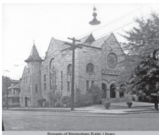
11 th Avenue