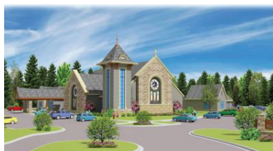
Future permanent home of Church at Ross Bridge