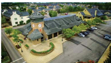
Current location of Church at Ross Bridge

God is opening doors for ministry opportunities that are unprecedented. But to embrace these opportunities it will require that we each seek and depend on the Lord like never before. We will each need to examine what sacrifices we can make and come together to bring those before the Lord in order to make God's BEYOND vision for us a reality!